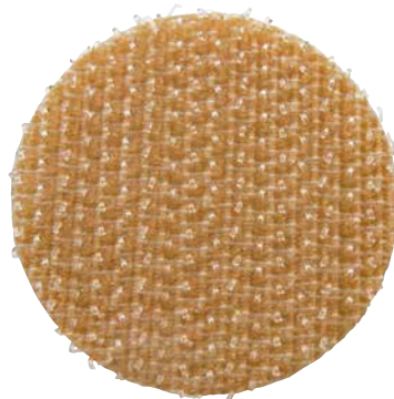
Adhesive-backed hook and loop tape