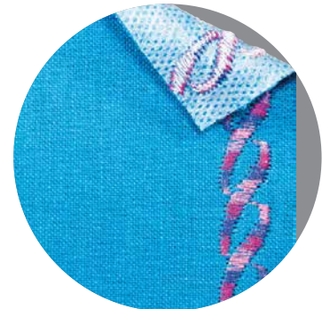
Embroidery with self-adhesive stabilizer